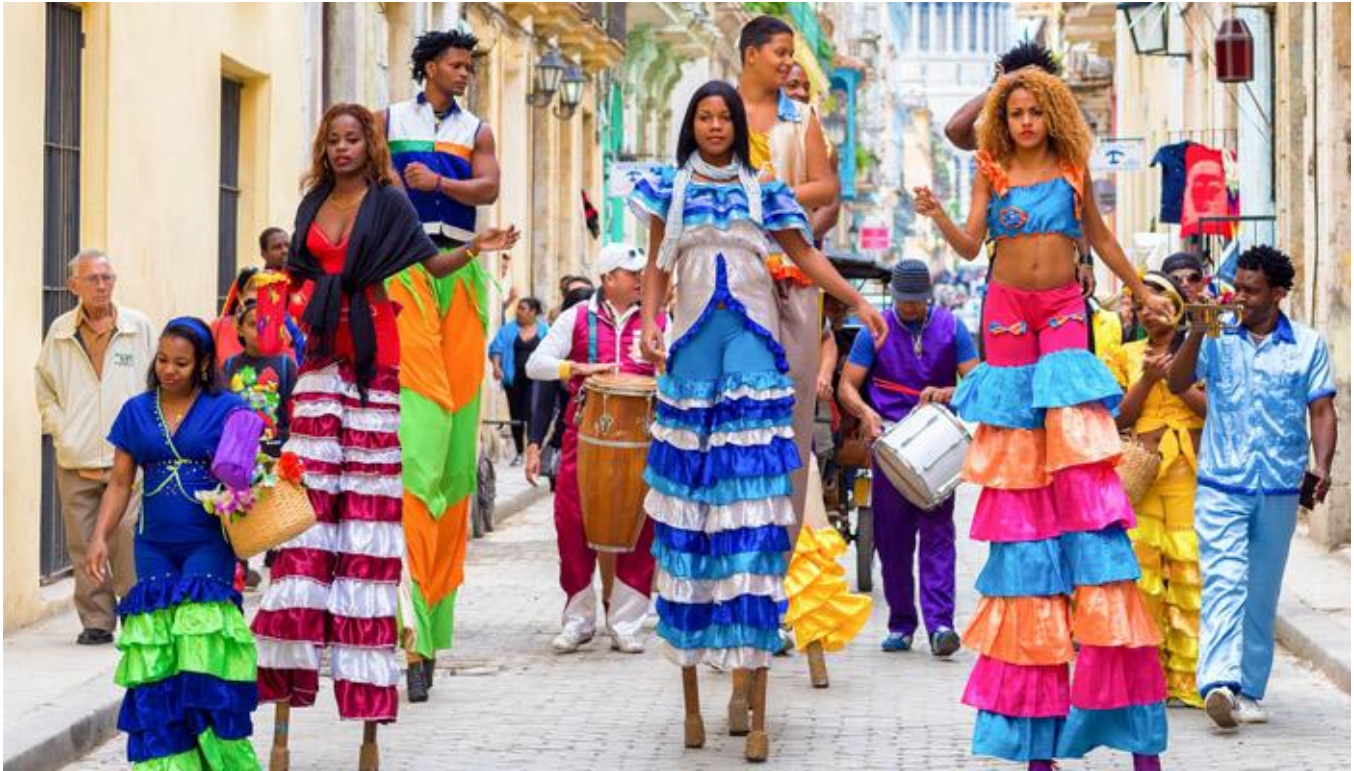
Colorful band of musicians and dancers on stilts on a narrow Old Havana.