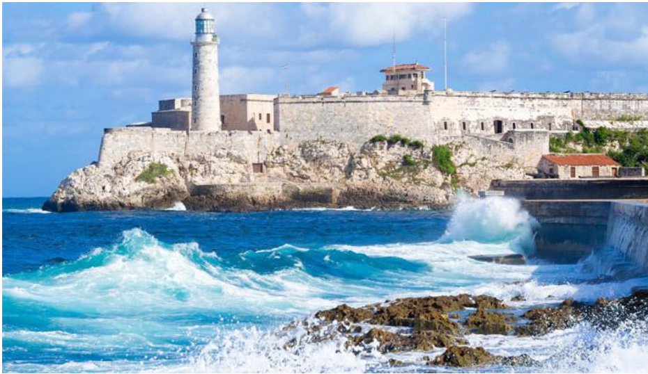
El Morro castle in Havana with sea waves crashing on the Malecon seawall.

4 – Then on to Plaza Vieja, the only civic square of colonial times. Absent are the churches, and government buildings, and is in contrast surrounded by opulent aristocratic 17th century residences. We'll visit an important center for the visual arts. After visiting the old squares we will continue to Havana's National Art Museum. Take in the exhibits and through this expression of art the Cuban culture really enlightens its admirers. Just in front of the Art Museum is the Historical Revolution Museum. This is a great display and a reminder of Cuba's struggles for change. What a great day taking in the culture of Cuba and its people. A short bus ride takes us back to accommodations for the night.